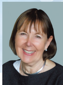
Frances M Ashcroft DBE, FRS, FMedSci