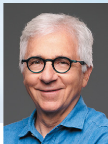
Douglas A Melton, PhD